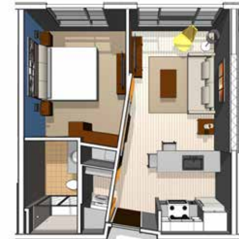
One Bedroom Residence

Enjoy everything Glenwood South has to offer in a comfortable one-bedroom residence. Take advantage of the fresh air from your private living room balcony. Your temporary home at Revisn Raleigh is defined with modern luxury including fully equipped kitchens, relaxing living rooms, sumptuously appointed bedrooms and generous bathrooms. Each residence includes the latest in connectivity and entertainment.