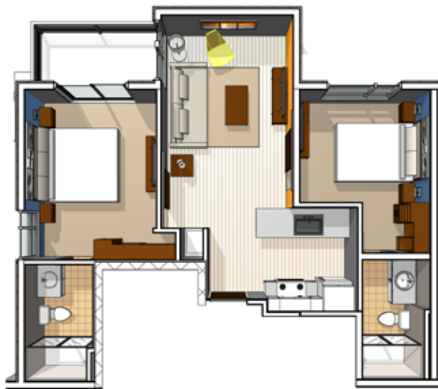
Two Bedroom Residence with Balcony