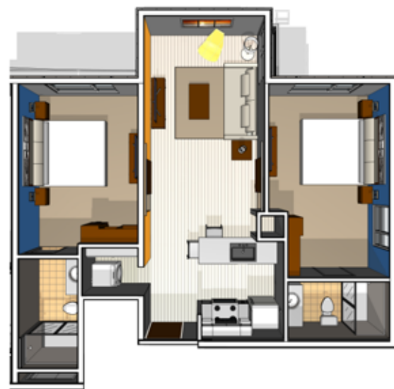
Two Bedroom Residence