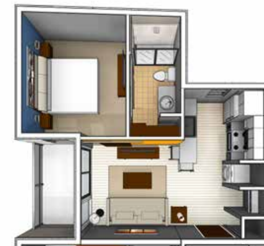
One Bedroom Residence with Balcony